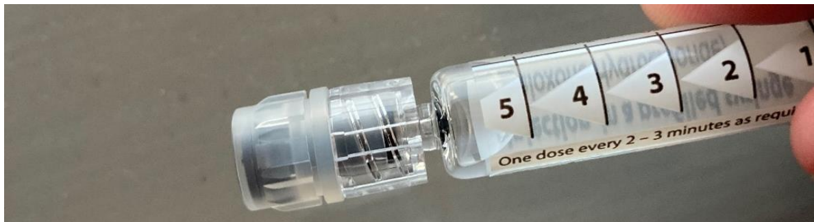
Image detailing the clear plastic cap at the end of the pre-filled syringe that must remain intact in order to maintain sterility of the medicinal product