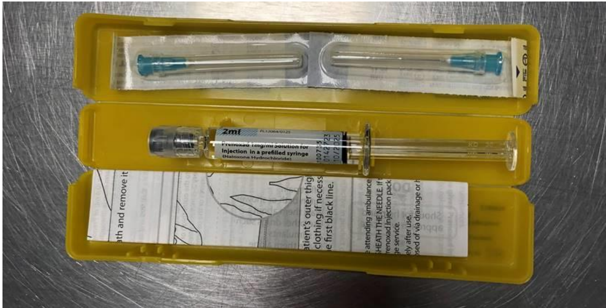
Two (2) Terumo 23 gauge 1¼ inch needles

Contents of an opened kit. Prenoxad kits are packed with two (2) Terumo 23 gauge 1¼ inch needles, along with the pre-filled syringe containing the active ingredient (naloxone hydrochloride), and a Patient Information Leaflet